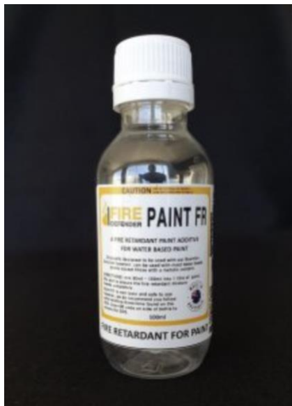
100mm Treats 1 litre water based paint

It is the responsibility of the purchaser to ensure that any Fire Defender product will suit the purpose and/or will meet the requirements of the building code you are required to comply with.