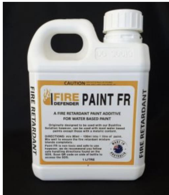
1 Litre treats 10 - 12.5 litres of water based paint